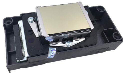
EPSON DX5 Printer Head